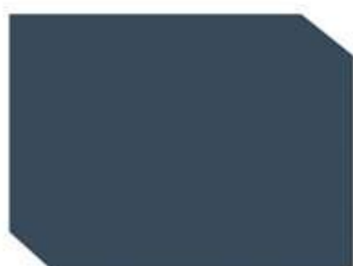
Blue Marine 4400